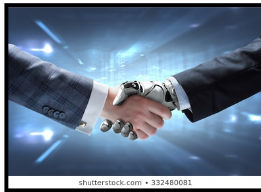
Fig 4: Robot handshake

Human interactions, computer language and artificial intelligence are depending on each other in today's scenario. It helps to reduce the man work, time consumption, hard work etc. On the other hand it increases unemployment. From the past few years, there is a big increase and improvement in technology.[3] We can do almost everything with the help of technology. Almost every work of humans can be done by machines. Artificial intelligence has become the very important part of the life of human in today's world. Now we are totally depend on artificial intelligence. Some of the scientists have concluded that machines can also do programming in future. But it is under process now. Artificial intelligence is increasing to a great extent.