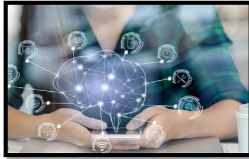
Fig 3: Human-AI Interaction design